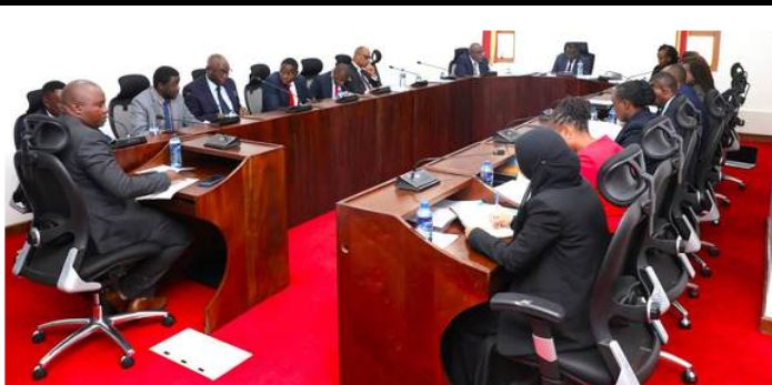
EIK Delegation Appearing Before the Senate Committee on Delegated Legislation on 24th and 28th July 2025 to Present the Petition on the EMCA 2025 Regulations

The Environmental Management and Coordination (Strategic and Integrated Environmental Assessments and Environmental Audits) Regulations, 2025 marked a significant milestone in environmental governance. Designed to institutionalize strategic environmental assessments (SEAs) and integrated environmental audits, the Regulations sought to embed environmental considerations into policies, plans, programmes, and projects, ensuring sustainability is considered at every stage of planning and implementation.