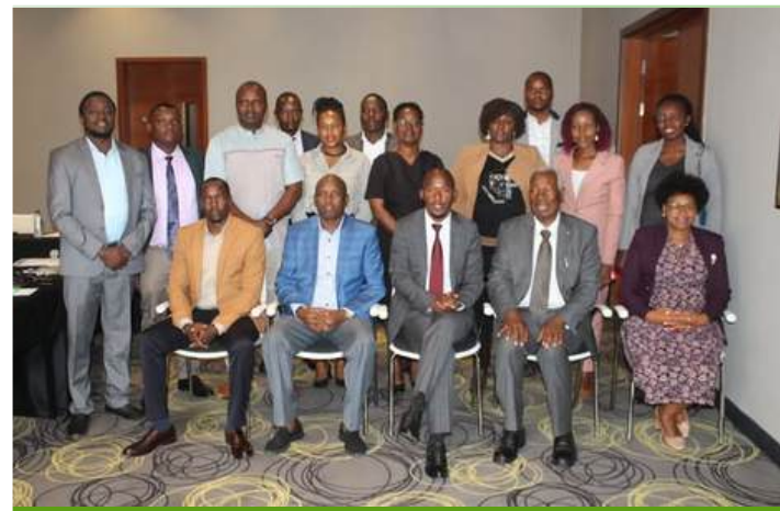
EIK Delegation Appearing Before the Senate Committee on Delegated Legislation on 24th and 28th July 2025 to Present the Petition on the EMCA 2025 Regulations