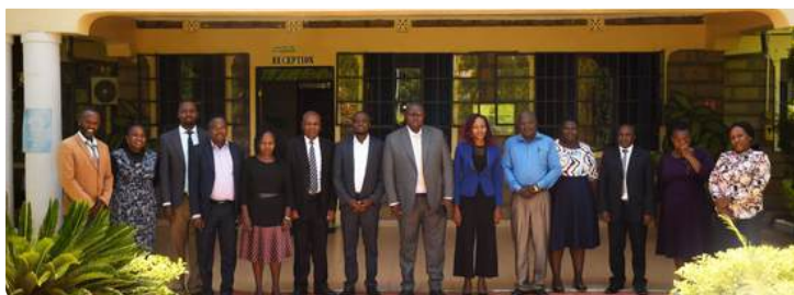
On April 8, 2025, EIK met with Tharaka University to explore partnerships on World Environment Day celebrations, joint training, and research initiatives to strengthen capacity building for students and environmental professionals.

The Environment Institute of Kenya joined Tharaka University in hosting National World Environment Day 2025, featuring a series of engaging events focused on fostering environmental awareness, promoting sustainable practices, and inspiring the next generation of environmental professionals. The 2025 WED theme, “Ending Plastic Pollution,” served as a powerful call to action, emphasizing the urgent need for innovative, sustainable, and inclusive solutions to address the growing plastic crisis in Kenya and beyond.